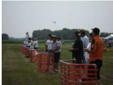
Here's a shot of pilots enjoying our Event!